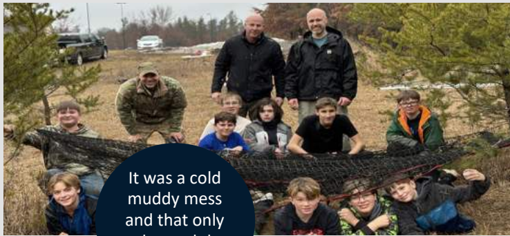
It was a cold muddy mess and that only enhanced the fun!

Each month, our middle school students participate in enrichment classes that involve bringing in members of the community to share their skills. In the month of February, the boys participated in an outdoor military style obstacle course as well as learned to make campfires. The girls had a self-defense and Pilates class. The students had a blast and we are grateful to the community members who were willing to invest time into our students by sharing their skills!.